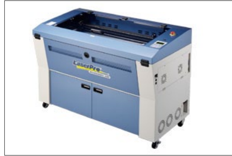
100w Laser Cutter 960mm x 450mm