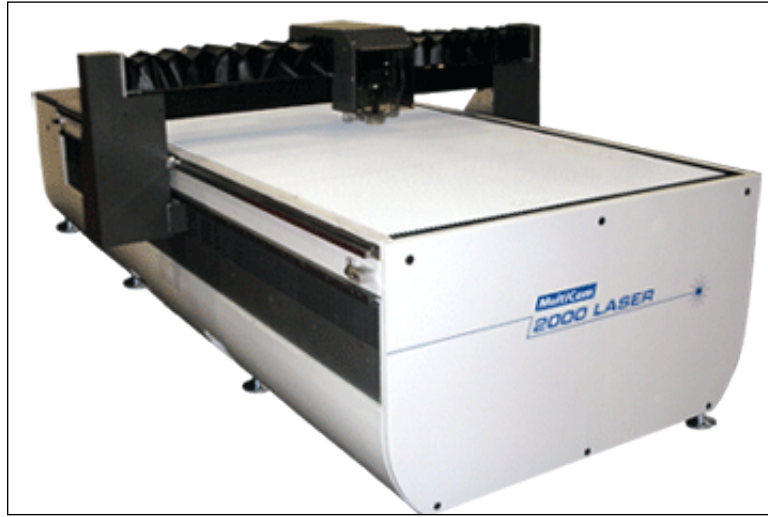
400w Laser Cutter 1.5m x 3m