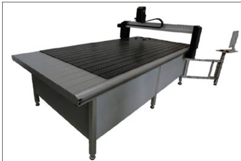
3 Axis Milling Machine 1.5m x 3m