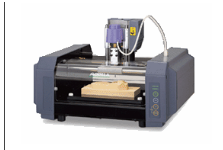
Small Milling Machine Modela MDX-20